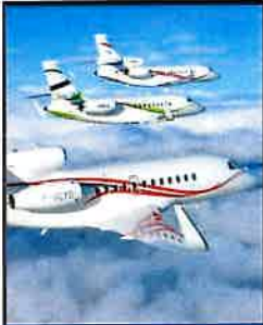
Aviation - Aerospace