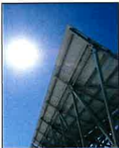
Clean- Green Tech