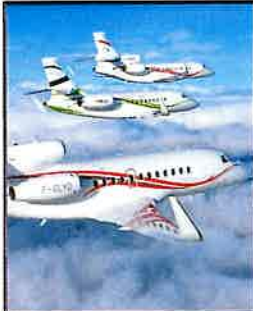
Aviation - Aerospace