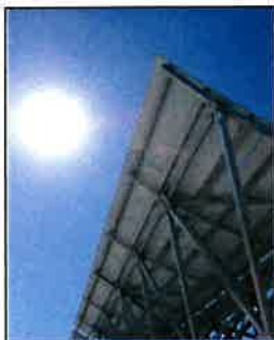
Clean- Green Tech