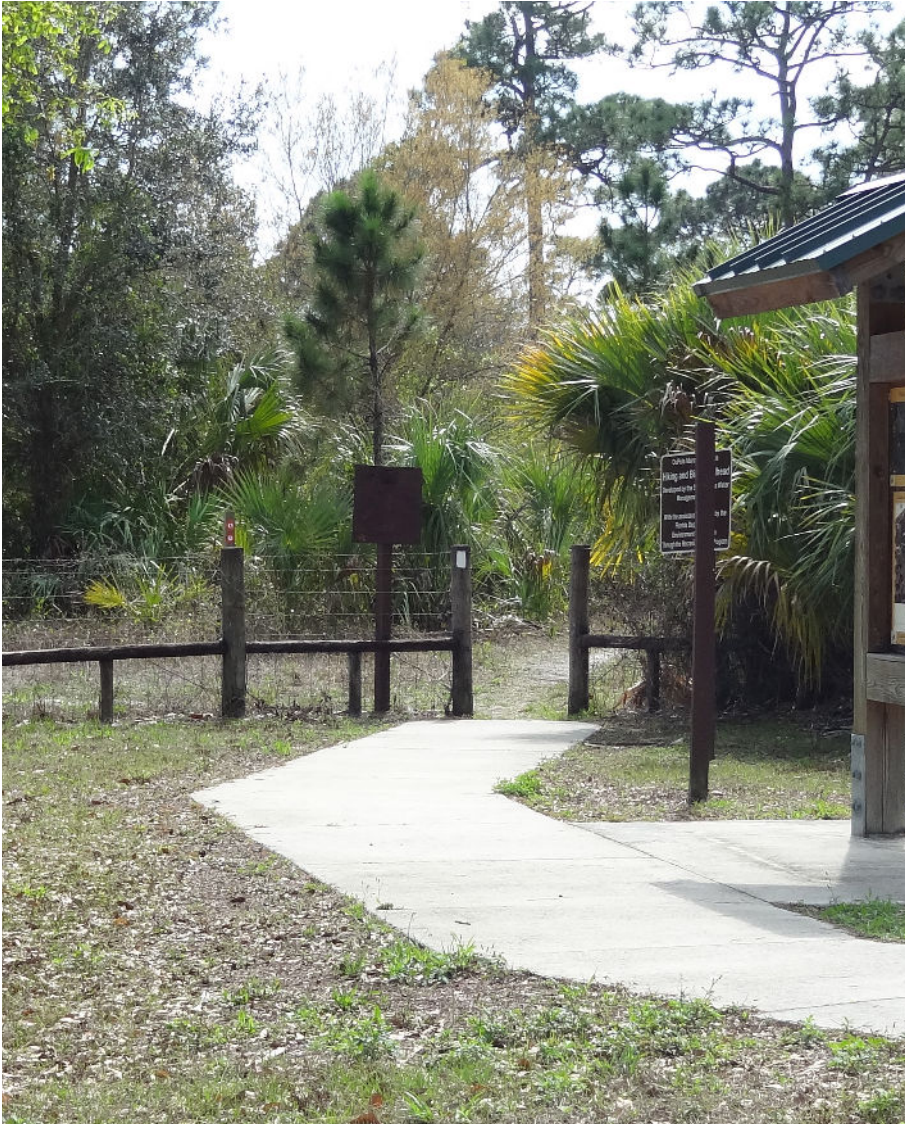
DuPuis Management Area.

like them; walkable cities and neighborhoods with great 3rd places for “incidental innovations”; and natural places where they can embrace and enjoy outdoor recreational opportunities. Beyond the ocean and mountains of California, places like Boise, Austin, and Nashville offer this combination – and have the growth to show for it. Most other cities can find ways to provide the clusters and the 3rd places, but simply