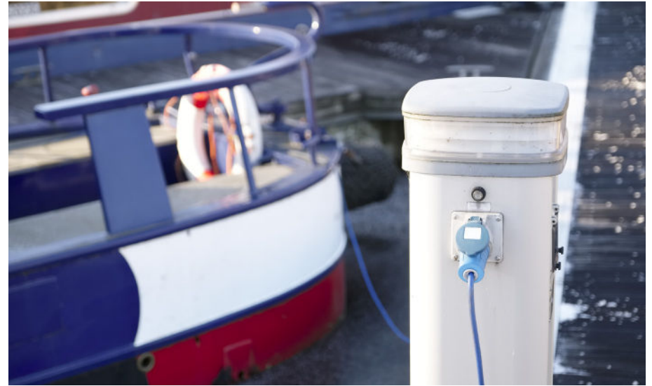
Electric boat charging.

Why this matters: Air mobility is not the only mode undergoing electrification at a rapid pace. In response to climate change concerns around the globe, all mobility is focused on electrification as a clean-