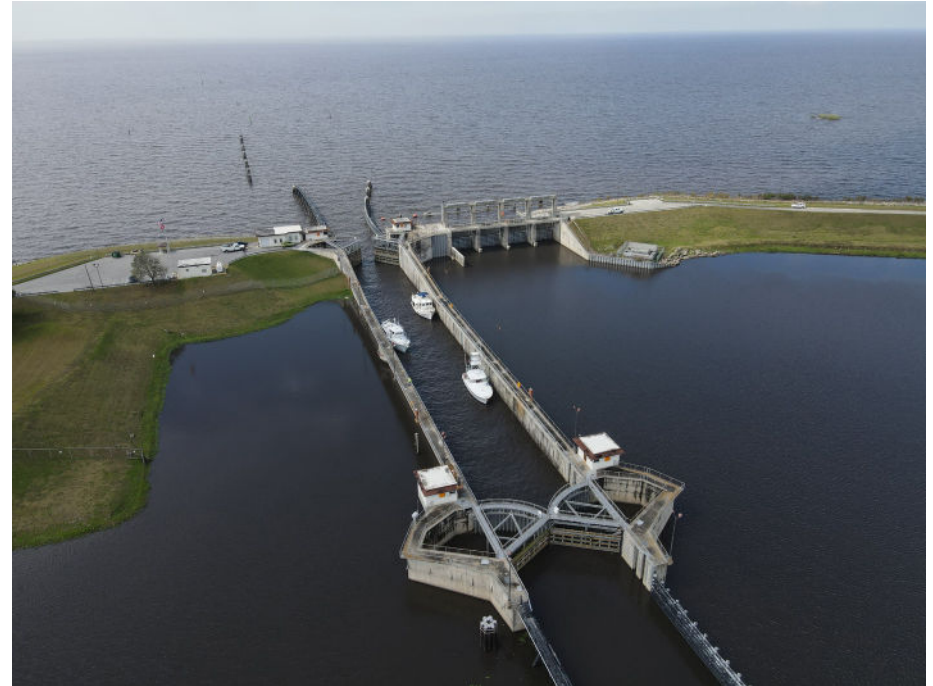
St. Lucie Canal connection to Lake Okeechobee.

Why this matters: Protecting the County’s brand and identity” is a major competitive advantage in the race for talent. A highly unique aspect of the expression of that brand are green corridors along major highways created with natural areas, farms and nurseries, and other parks and open spaces. To continue those brand protections, there is an opportunity to protect that image along SR 76. There is urgency to create such protections given the likely development pressure during the coming economic recovery. In addition, such a corridor can support recreational activities attractive to young talent. Finally, using such a corridor for bioswale water cleansing helps support the marine industry and ecotourism.