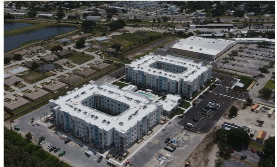
Four-story residential redevelopment of a struggling shopping center in Rockledge, Florida.

Without this increased flexibility, creativity, and related public investments, it could take 5-10 years for such areas to recover. Recovery could take longer if suburban areas are able to capture significant portions of their market share in the short term. Such increased sprawl-style development is counter to the goals, values, strategies, and brand of Martin County. There will be a significant opportunity cost if recovery takes too long.