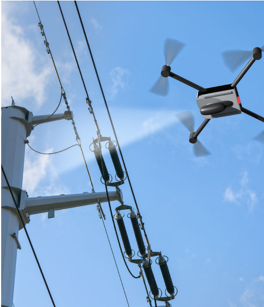
UAV inspection of electrical infrastructure.

in less populated areas. With nearby companies like Pratt Whitney, the western airport provides unrestricted airspace for testing that can eventually include flights to and from Witham Field, Pratt, and other nearby facilities. Such flights might include automated drone monitoring of Lake Okeechobee algal blooms, inspection of Florida Power & Light solar farms, and similar functions supportive of County goals and industries. The activity also provides a “first to market” advantage for Martin County.